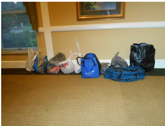
124 pairs of flip flops

. WOW! Our "Flip Flop" donations for Hope House Center for Women and Children was fantastic. In total, 124 pair of flip flops were donated. That should give them enough to supply everyone with a pair for 5-6 months depending on size distribution. There was a nice variety of sizes with 35 pair for children and 89 pair for the ladies.